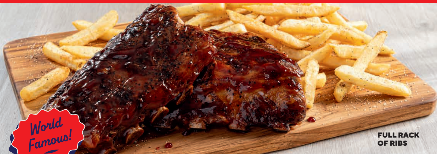
FULL RACK OF RIBS