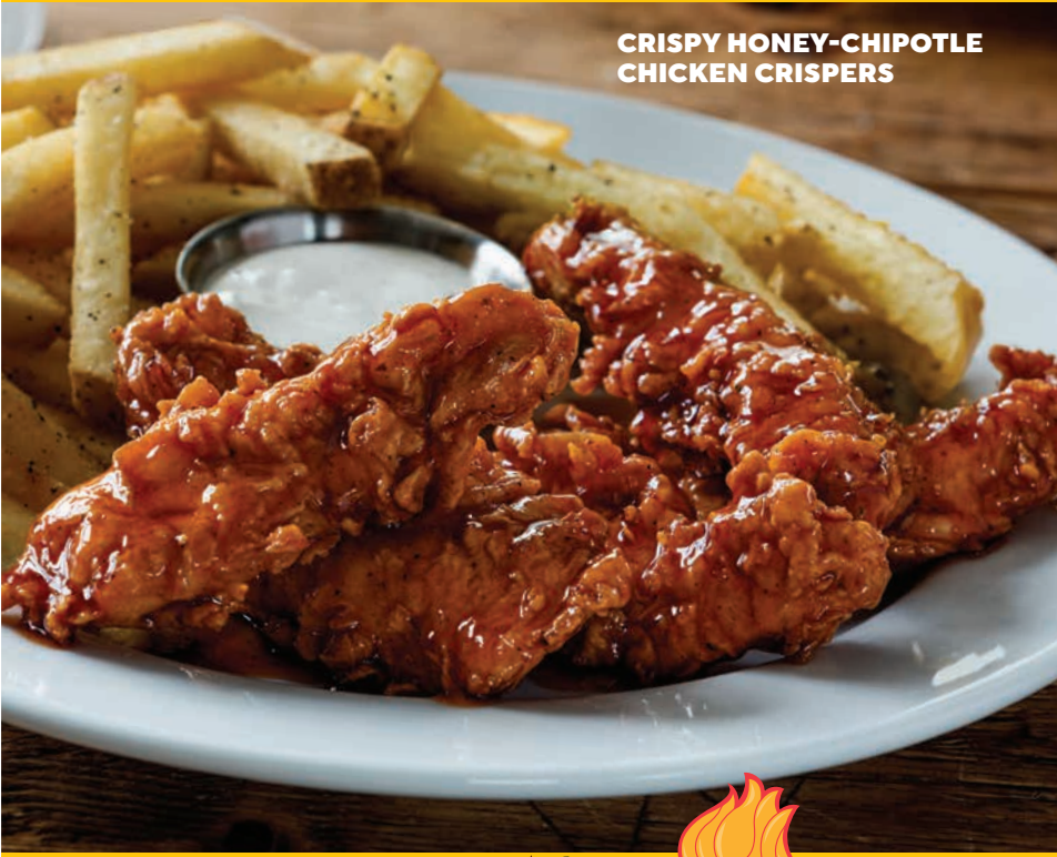
CRISPY HONEY-CHIPOTLE CHICKEN CRISPERS