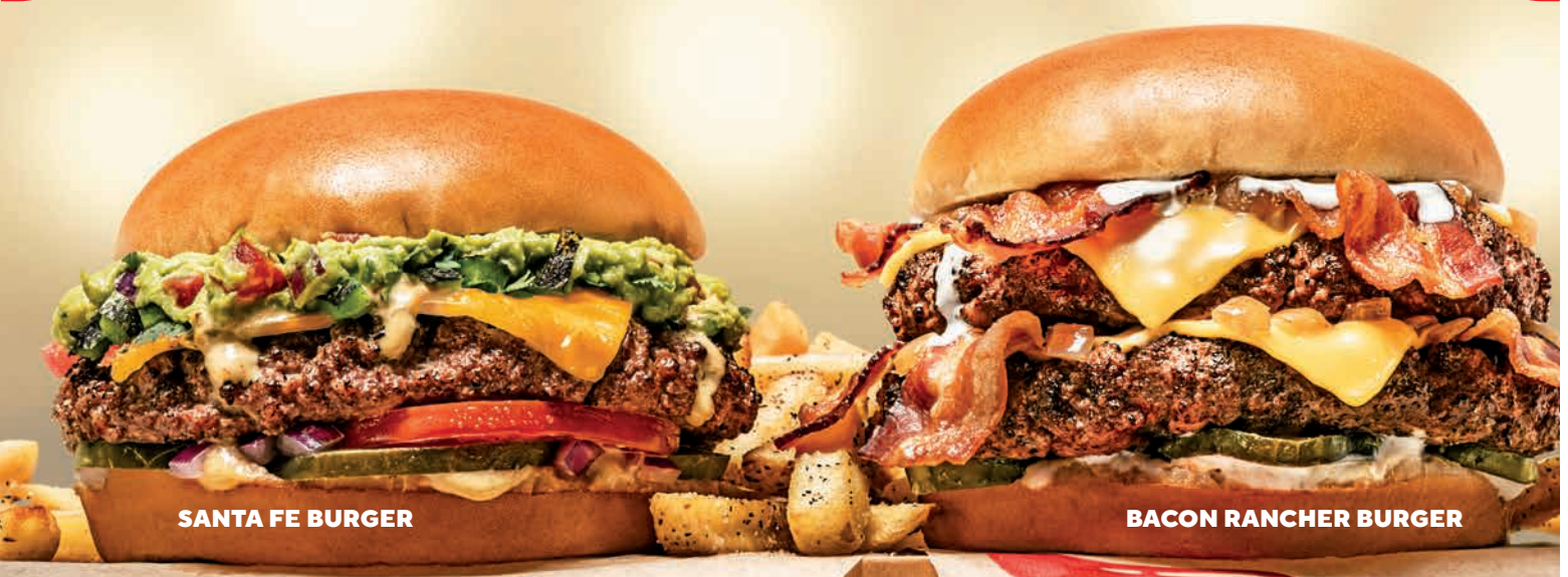
SANTA FE BURGER