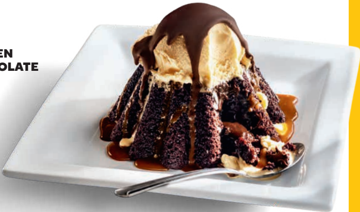
MOLTEN CHOCOLATE CAKE