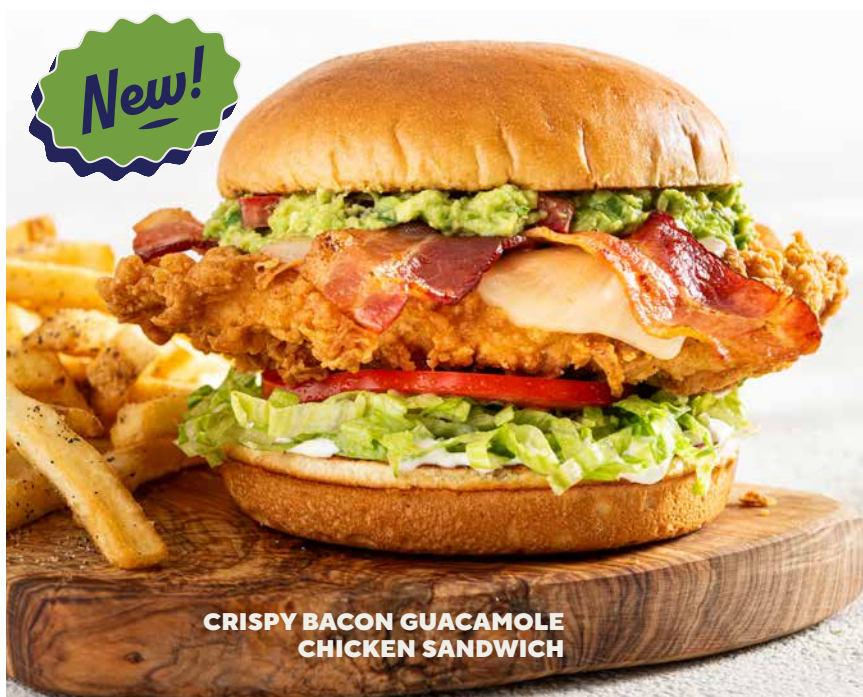
CRISPY BACON GUACAMOLE CHICKEN SANDWICH