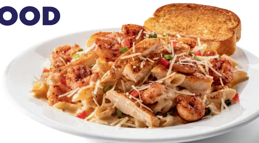
ULTIMATE CAJUN PASTA

Salmon, lightly brushed with garlic butter & herbs. Served with Mexican rice and seasonal veggies. 28.50