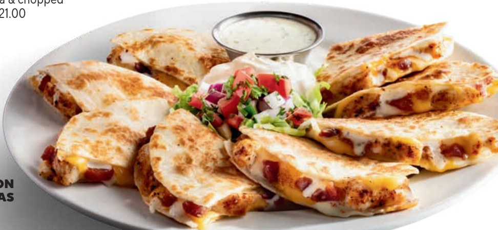
CHICKEN BACON RANCH QUESADILLAS

Grilled chicken 20.50 Shrimp 20.50 Steak 23.00 Veggies 20.50