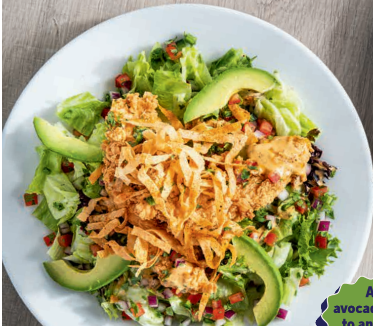
SANTA FE CHICKEN SALAD