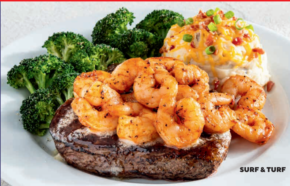
SURF & TURF

Seasoned & topped with garlic butter. Served with loaded mashed potatoes, seasonal veggies. 33.50